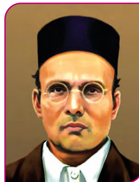
Swatantryaveer V. D. Savarkar

Swatantryaveer Vinayak Damodar Savarkar founded 'Mitramela'- a secret organisation of revolutionaries in Nasik. The same organisation was renamed as 'Abhinav Bharat' in 1904. Savarkar went to England for higher education. From there he began sending revolutionary literature,